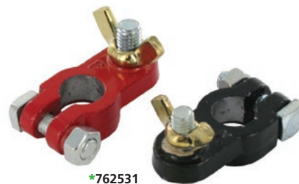
'Wing-Nut' Battery Terminals (Lead, Epoxy Coated)

762531 Set of 1 Pair: 1 Red/Positive (3/8" Stud) & 1 Black/Negative (5/16" Stud). Epoxy coating helps with polarity identification & resistance to corrosion