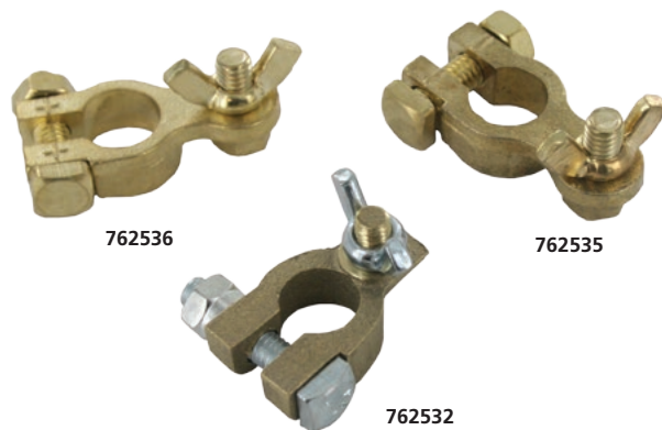
'Wing-Nut' Battery Terminals (Brass)

762534 Set of 1 Pair: 1 Positive (3/8" Stud) & 1 Negative (5/16" Stud)