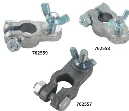
'Wing-Nut' Battery Terminals (Lead)

762564 Set of 1 Pair: 1 Positive (3/8" Stud) & 1 Negative (5/16" Stud)