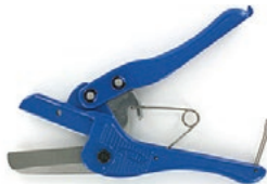
WT-1 Cutting Tool