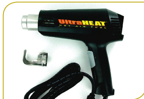
Heat Shrink Gun – Flameless