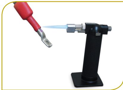
Heat Shrink Torch – Medium Duty