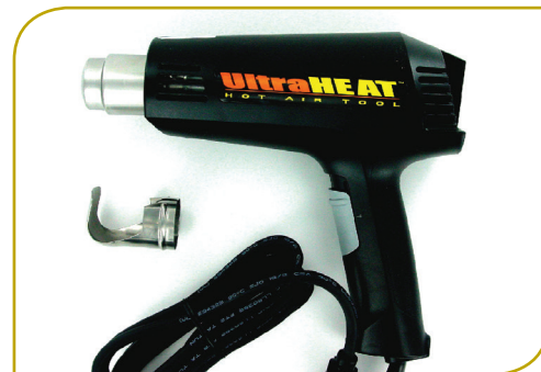
Heat Shrink Gun – Flameless