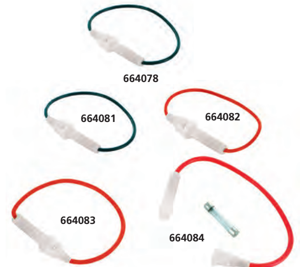
In-Line Fuse Holders