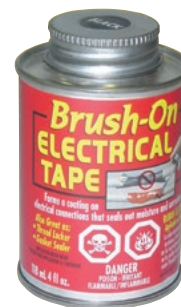
Liquid Electrical Tape