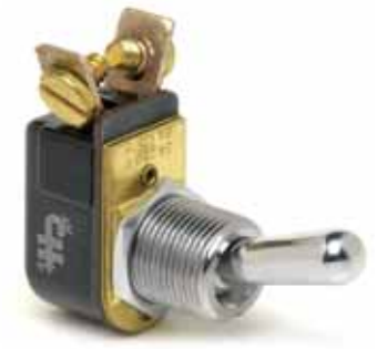
Ball handle: 3/8" (9.52mm) long.