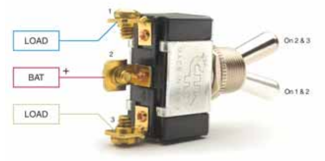
SPDT On-On Only one of the loads can be energized at a time.