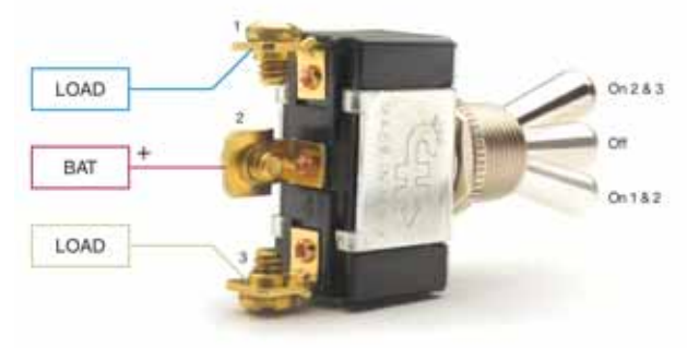
SPDT On-Off-On Only one of the loads can be energized at a time.