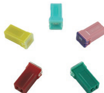
Cartridge Fuses (Fusible Link, Female Termination)