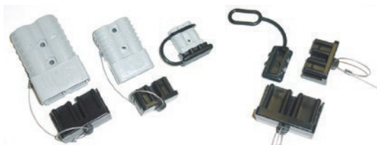
Fast 'N' Safe Battery Connector Protective Covers