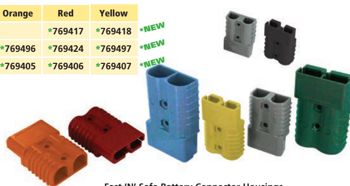
Fast 'N' Safe Battery Connector Housings