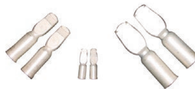
Fast 'N' Safe Battery Connector Contacts

Recognized under the component program of Underwriters Laboratories, Inc.