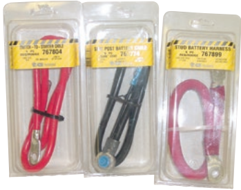
New Packaging for Battery Cable Assemblies