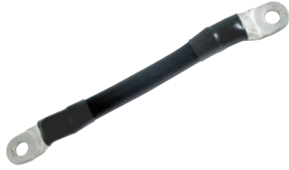
Stud Battery Harness (Stackable)