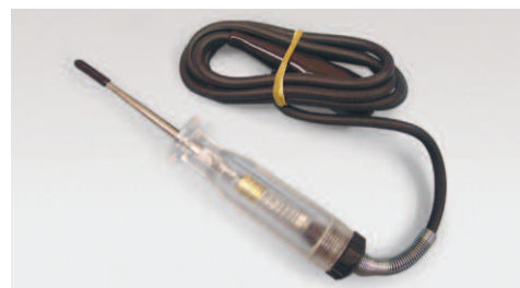
764700 Circuit Tester