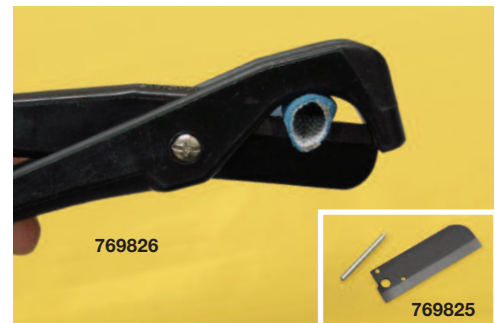
Tube/Loom Cutter & Replacement Blade

769825 Replacement blade for 769826 . Easy to install.