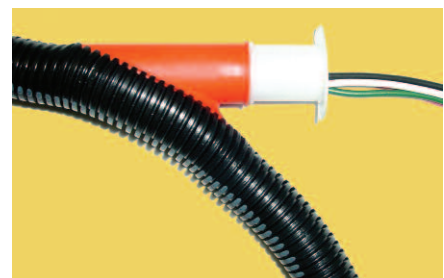
Split Loom Installation Tools