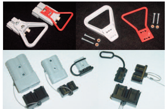
Fast 'N' Safe Battery Connector Handles and Protective Covers