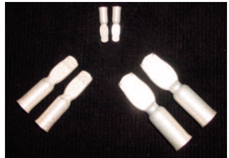
Fast 'N' Safe Battery Connector Contacts