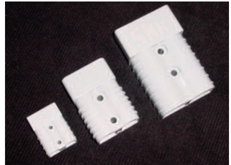
Fast 'N' Safe Battery Connector Housings