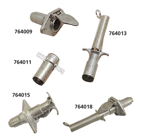
6-Pole Trailer Connectors (Heavy-Duty)

764074 Flexible rubber boot provides weather-proof protection at rear of 6-pole socket. Fits 764009 .