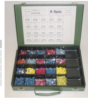
560500 Economy Terminal Assortment Kit in a Metal Case