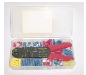
560175 Economy Terminal Assortment Kit – with Tool

Available with or without a crimp tool... your choice!