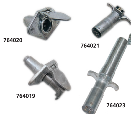
Heavy-Duty 4-Pole Connector