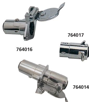
Medium-Duty 4-Pole Connector (Socket and Plug)